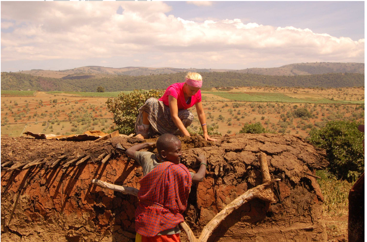
Hut building among the Masai. Among the Masai community, it's the women that build houses and you will get a chance to "help build a house"

The Masai Mara is considered by many to be one of the World's finest game reserves. The rolling grasslands offer ideal game viewing and photographic opportunities and rocky outcrops, which are favourite midday resting places for lion, for which the Mara is famous, break the grassy plains. Some of the other animals, which can be seen in and around this 700 square mile conservation area, include elephant, black rhino, buffalo, leopard, cheetah, wildebeest, zebra, and gazelle. Hippo and crocodile abound in the muddy brown waters of the rivers, which traverse this Reserve. One of the Mara's main attractions each year is the astonishing spectacle of the annual migration of up to two million wildebeest, thousands of zebra and an escort of carnivores from the Serengeti plains, following the rains and succulent new grass. A costly trek as many of the lame, laggard and sick will fall prey to the ravening pack of predators and many more will die in the swirling flood waters trying to cross the Mara River. Once the rains have ended and the grass begins to wither the wildebeest turn south and head back to the Serengeti and beyond. The reserve with an area of 1510 km 2 forms the northern part of the Serengeti-Mara ecosystem and is famous for vast assemblages and migration of plains game and their associated predators. The park's southern boundary is contiguous with Tanzania's Serengeti National park.