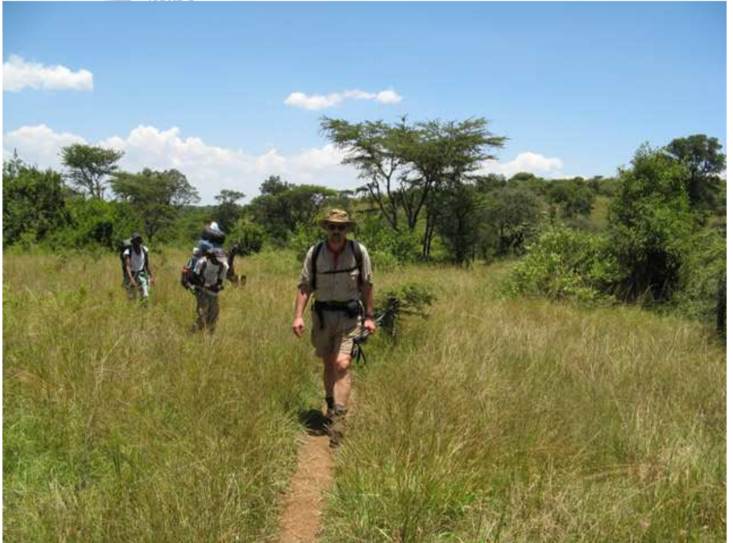
Hiking the Nguruman Hills