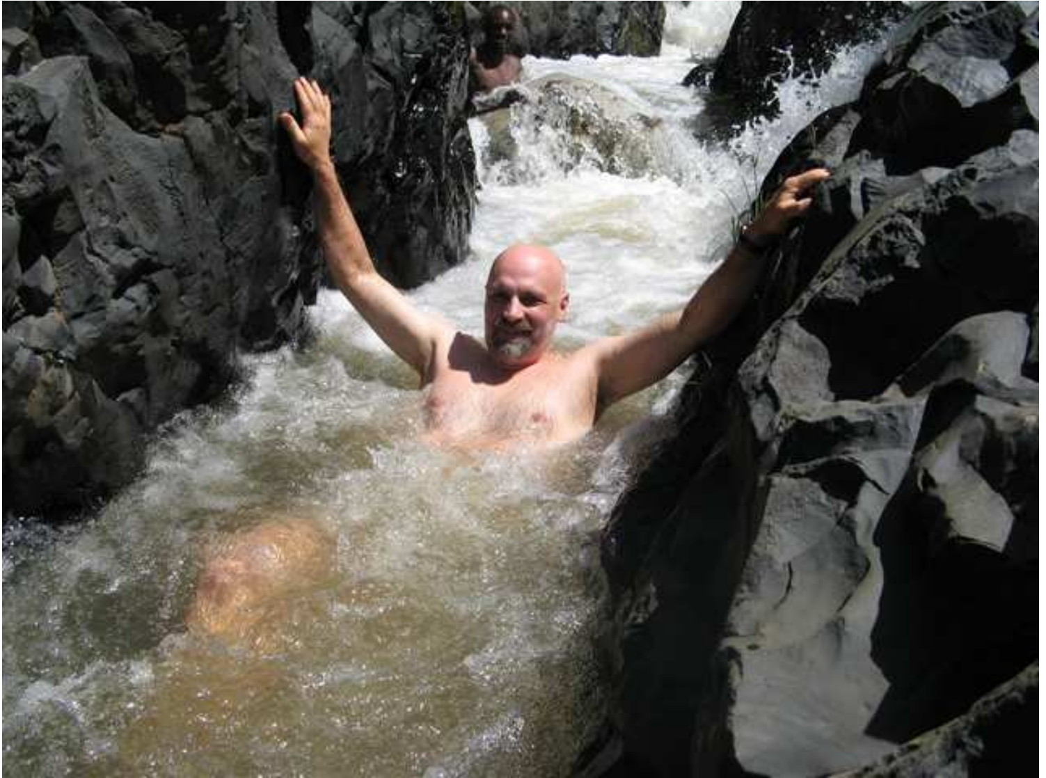
Pass time at the Nguruman Hills

The next two days will take us across this great scenic country and great people. Some of our guides and porters come from this area and they are always happy to invite us to their homes where we meet their families and even introduce us to their tribesmen and their schools. On occasions we have come across weddings which have been a great eye opener and fun-filled. The hikes through the forests and plains give us pleasures of enjoying all that this tremendously rich forest has to offer. There are many varieties of birds including Hartlaub's Turaco, the Gureza Colobus Monkey and many trees and plants of cultural and medicinal use to the local Masai people. Most of the afternoon will be at leisure or taking short hikes or bird walks with the guides or visit with our hosting families. Meals and overnight at our private camp. (B, L & D)