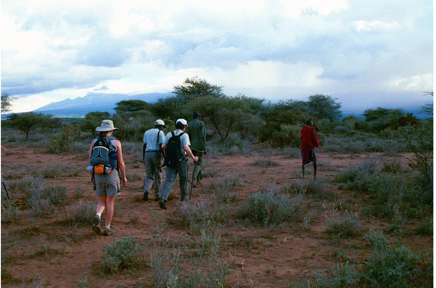
Hiking in the Loita plains.

After breakfast at the Fairview hotel, we leave at 0900hrs, heading in a north westerly direction we descend into The Great Rift Valley. There will be picnic lunch enroute reaching our private camp at Barakitabu at approximately 1500 hrs, we will settle in before proceeding on a late afternoon walk across the plains. Return to camp for a hot shower, drinks around the camp fire before dinner. After dinner a chat around the campfire before retiring for the night to the sounds of the wind in the trees and the occasional animal noise. Overnight at our private camp at Barakitabu. (1B, 1L & 1D)